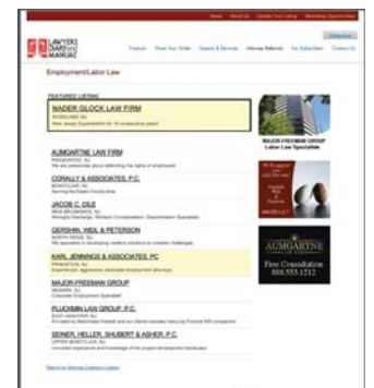
Specific Practice Area Page 3 priority ads allowed on the page - $1,000 per ad

Web Ads are sold on a First-Come, First-Served basis.