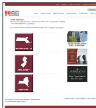
Attorney Search Home Page 3 ads allowed on the page - $750 per ad

MAXIMIZE your exposure and STAND OUT from your competitors with a Display Ad! ->