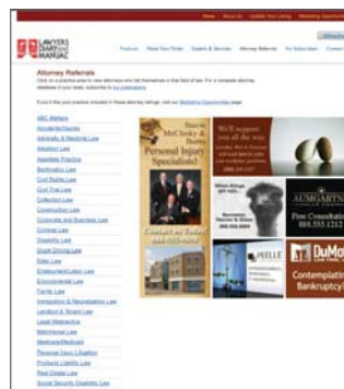
State Attorney Search Page 9 ads allowed on the page - $1,000 per ad