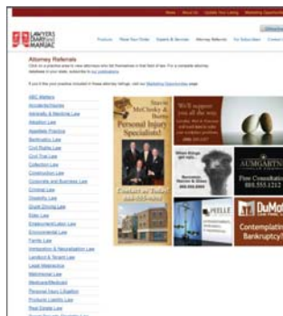
Category Page 9 ads allowed on the page - $1,000 per ad