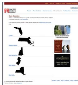
State Page 3 ads allowed on the page - $500 per ad

Lawdiary.com ensures your message reaches your target audience with accurate and timely information